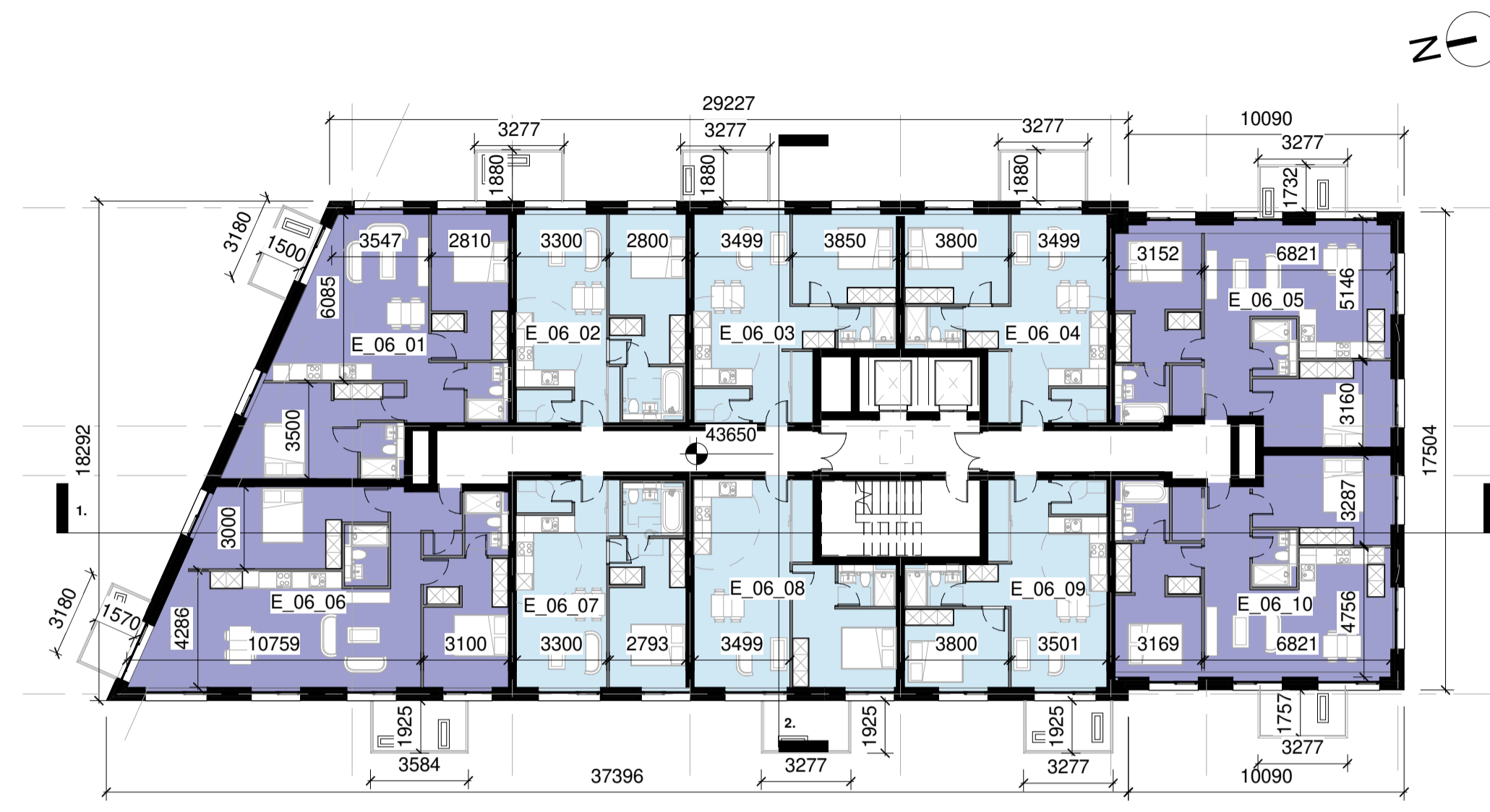
06 1 : 200