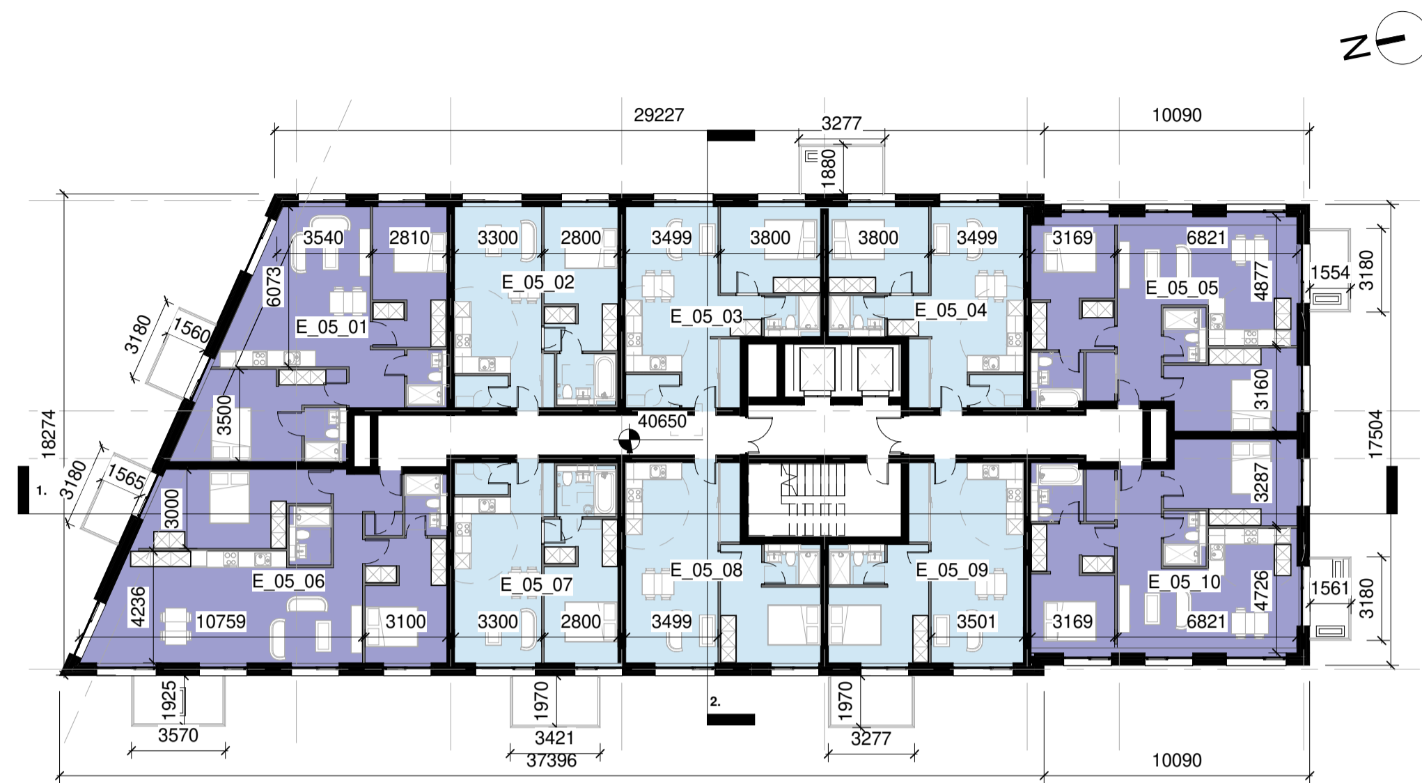
05 1 : 200