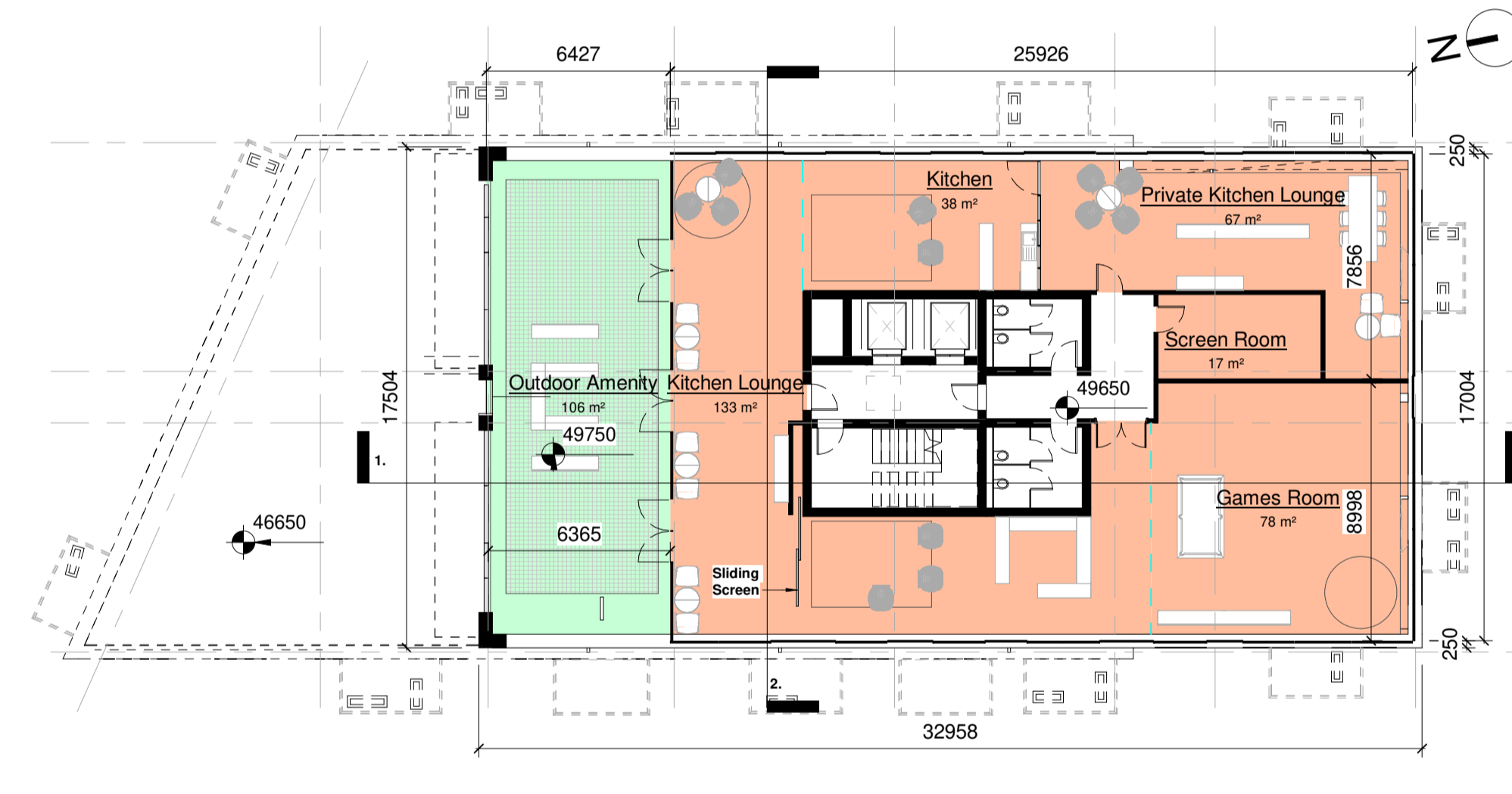
08 1 : 200