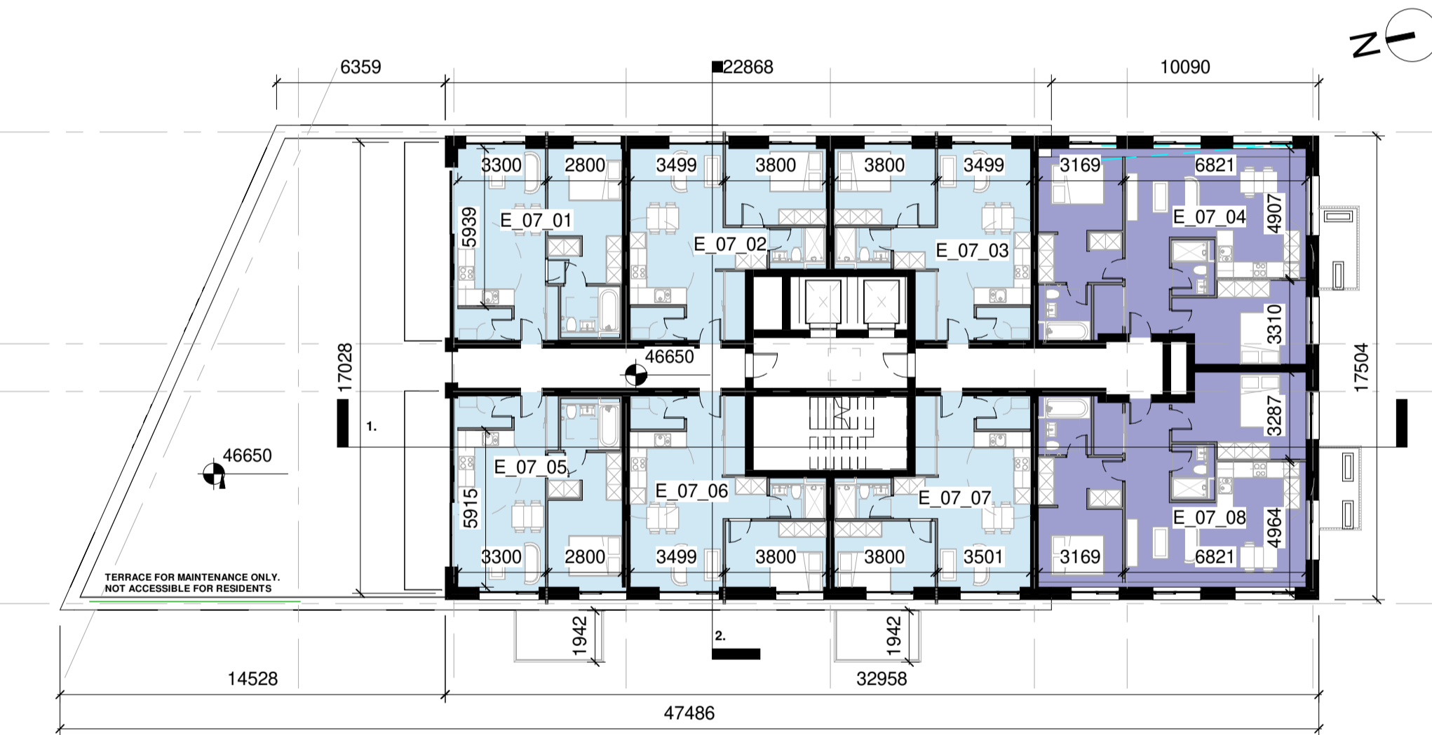
07 1 : 200